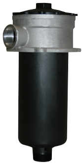
GRTB | 100 gpm, 100 psi Elements: KGZ & KBGZ