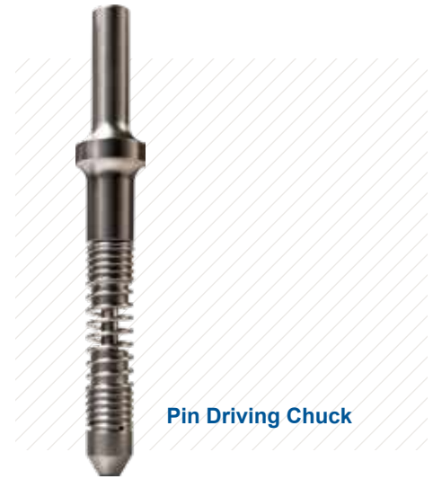
Pin Driving Chuck

Presses and air hammers with pin chucks allow for better axial alignment, control, and quicker cycle times compared to a hammer. These are great solutions for small to medium volume production. Additionally, pin driving chucks are cost-effective and versatile tools that allow manufacturers to control alignment and insertion depth. Furthermore, the chuck will hold the pin securely in place prior to and during installation. The pin driving chuck has an internal punch with a diameter smaller than the hole but greater than the pin's chamfer diameter. This is critical for effective installation.