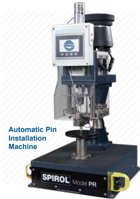
Automatic Pin Installation Machine